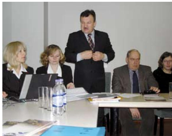
Implementation Team of Preili – Varkava presents their work to auditors

To assist local authorities and to reduce EMAS implementation time German experts has offered to focus efforts of all project participants on developing the EMAS Master Manual, which could be used as a template by each of the local authorities for elaborating their individual environmental manuals.