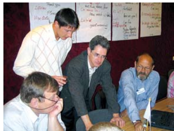
Trainer, Experts, Translator