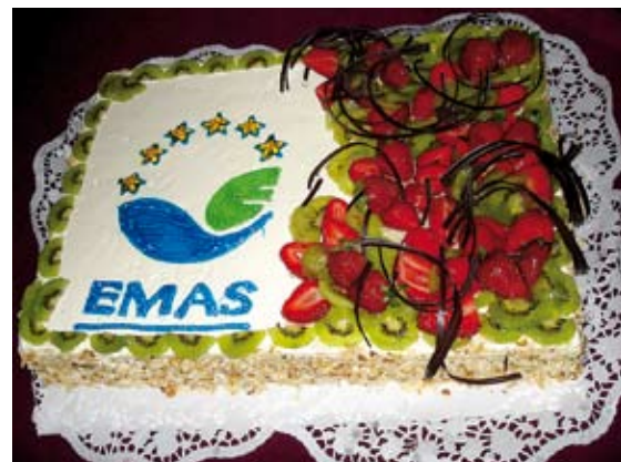
Celebrating successful Training week with EMAS cake