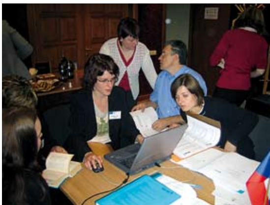
Members of the International Expert group