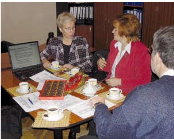
2 nd intermediate audit in Naujene rural municipal council

Apart from quality assurance the audits had a disciplinary effect upon the project participants forcing them to stay in the project schedule. In the given project all municipal councils were developing their systems themselves, which created a valuable experience/expertise in the local authorities' staff. Local and German consultants were assisting local authorities only by advising and checking system documents.