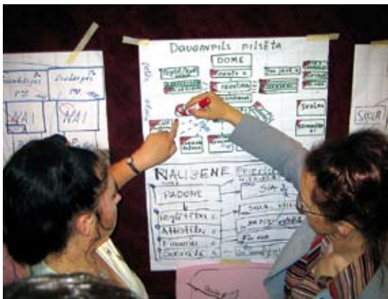
EMAS scoping in training session

At the training sessions participants were seated at the tables in working groups consisting of cluster members and assigned consultants. Active cooperation in clusters started on the very first day of the training owing to preparation of mutual presentations and working together on different exercises. Interactive and intensive training has united cluster participants and consultants creating a good basement for the future work on EMAS implementation.